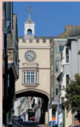
Top and left - Totnes Fore Street; Below and below left - River Dart

A footpath runs along the riverside from Totnes to Dartington, with plenty to see all year round, the birdlife includes the previously mentioned water birds as well as the greater spotted woodpecker, nuthatch, great tit, blue tit and many more woodland species to be seen in the trees that line the river. At the bridges have a good look at the water and watch the mullet feeding on the bottom of the riverbed, you may be lucky to see salmon and trout as well as eels.